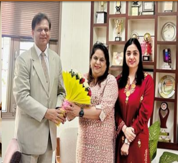
DIRECTOR KEDGE BUSINESS SCHOOL

“Mind, stretched by new ideas, may never return to its original dimensions.”