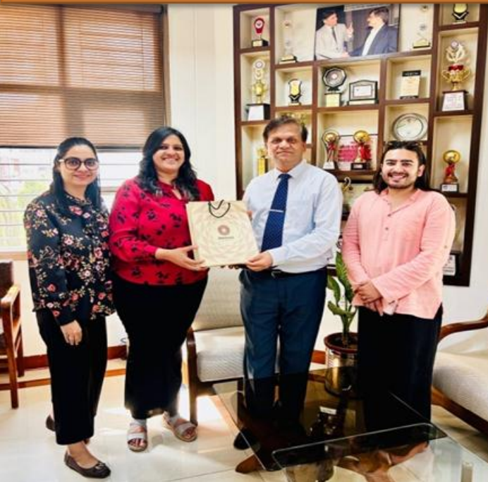
DELEGATES FROM ASHOKA UNIVERSITY