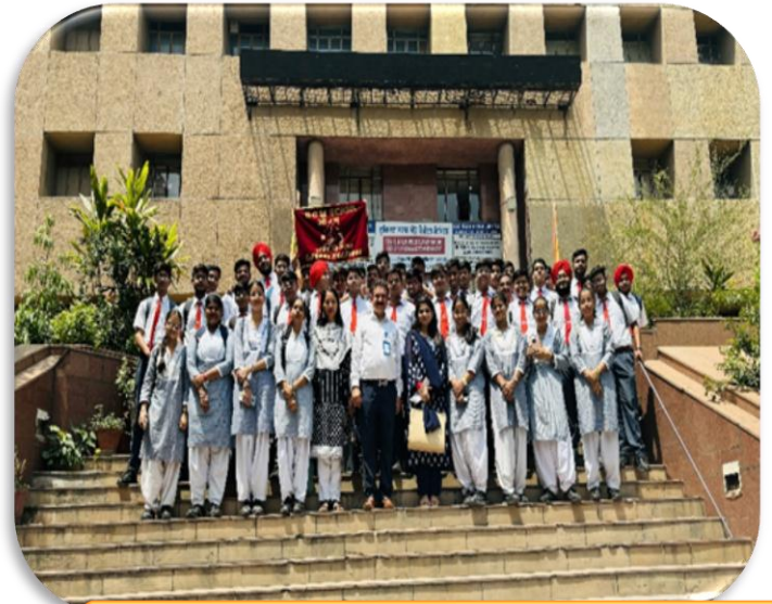
VISIT TO LUDHIANA STOCK EXCHANGE