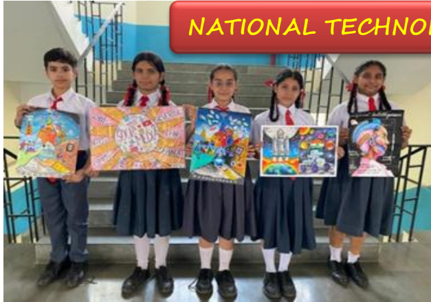
NATIONAL TECHNOLOGY DAY