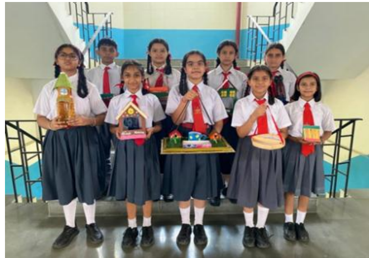
INTERNATIONAL DAY OF BIODIVERSITY