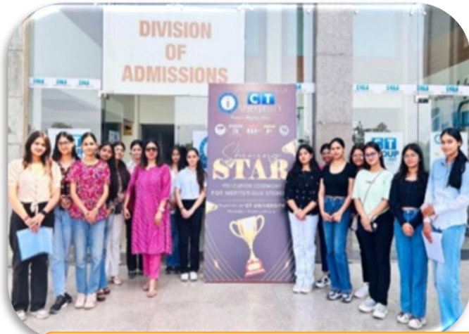
FELICITATION CEREMONY AT CTU