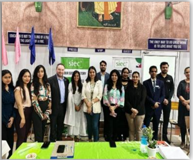
2 Day Career Fair, a collaborative event between BCM School and IC3, offered a vibrant global atmosphere with university representatives. Students gained valuable insights for their academic and career journeys.