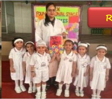
RED CROSS DAY