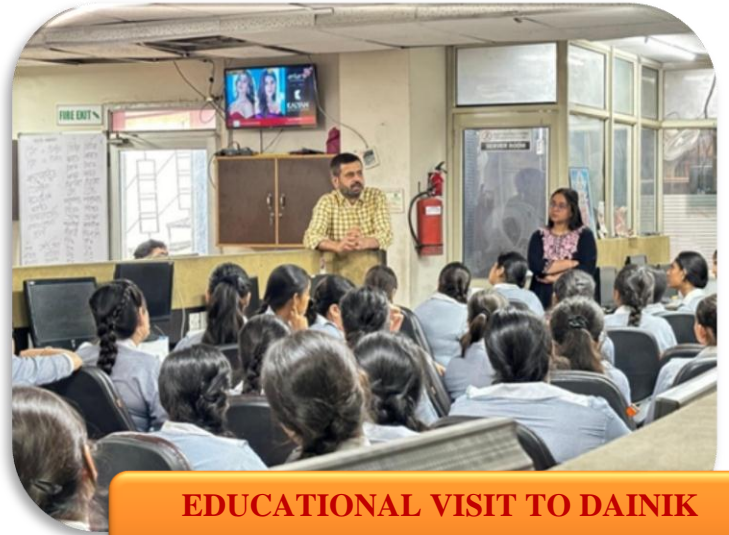
EDUCATIONAL VISIT TO DAINIK JAGRAN, JALANDHAR