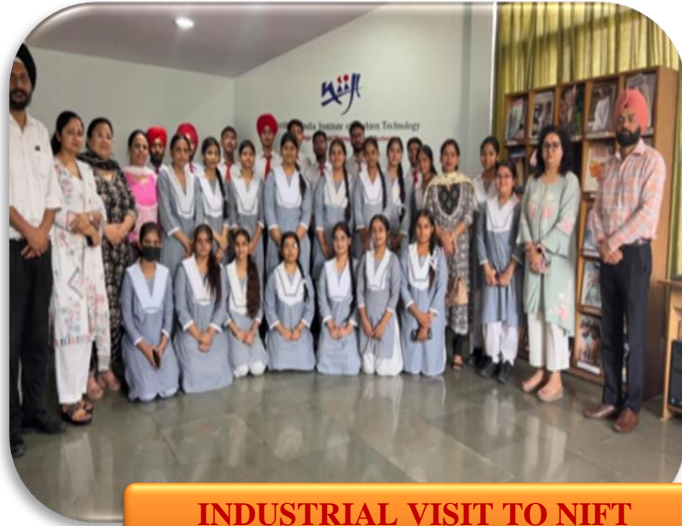
INDUSTRIAL VISIT TO NIFT