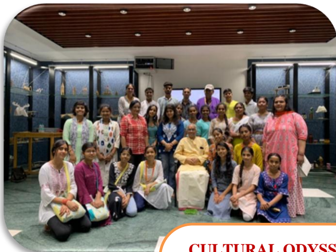
PARTICIPATION IN YUG PROGRAM